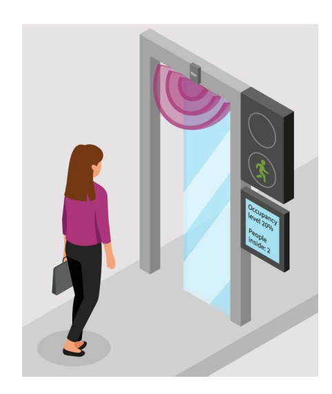
60 GHz radar mounted at the top/ceiling of the door